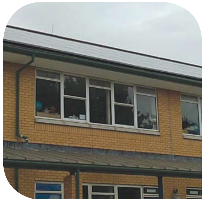
Landscape report. Page 6.

Why not visit our new website www.sustainablecrediton.org.uk