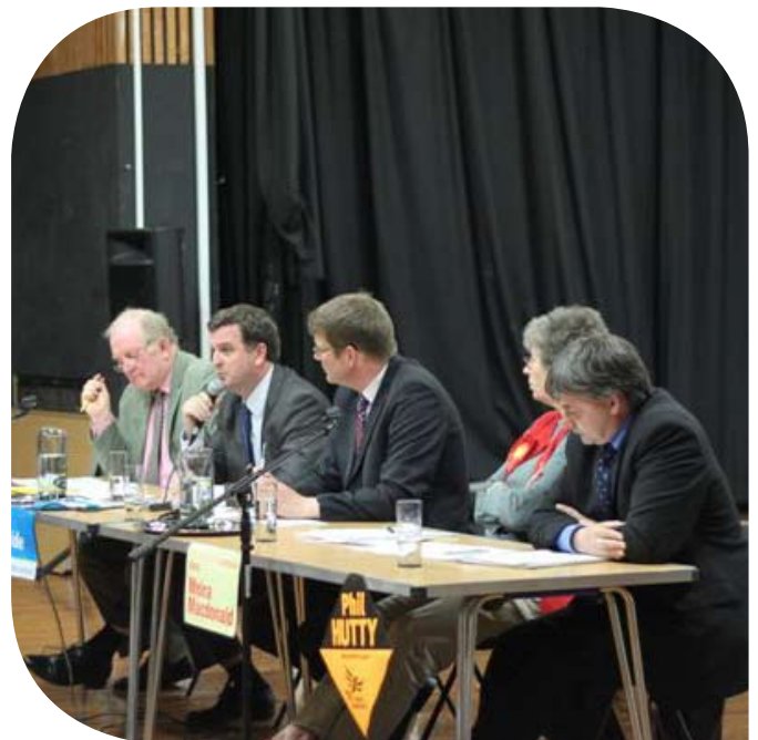
Crediton General Election Hustings, 2010

UKIP appear to be sceptical about climate change and would act on the precautionary principle. Having said that, their candidate then went onto to say that we should start burning the 400 years worth of coal still available underground!