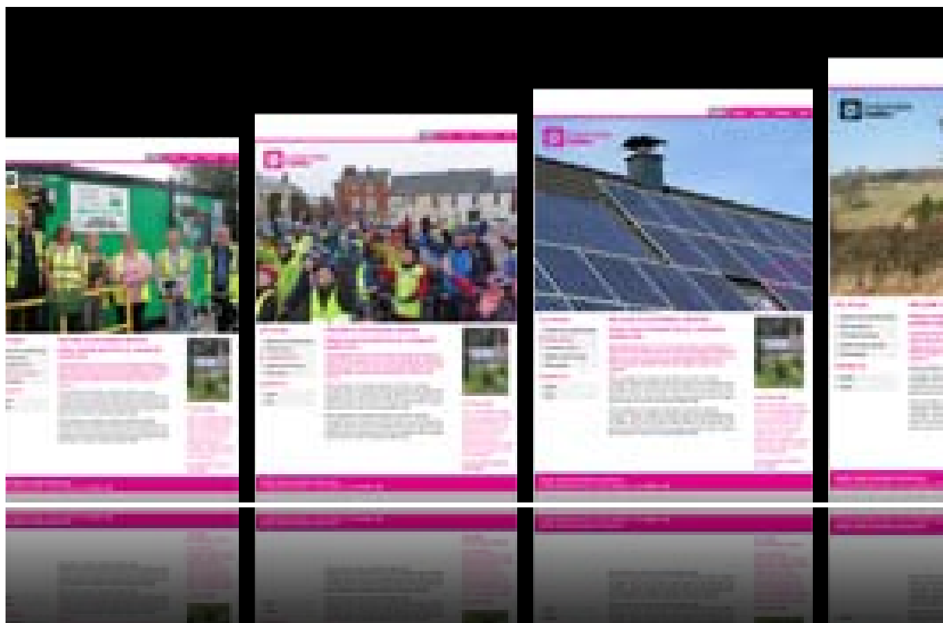
Sustainable Crediton's new website.

Why not visit our new website www.sustainablecrediton.org.uk