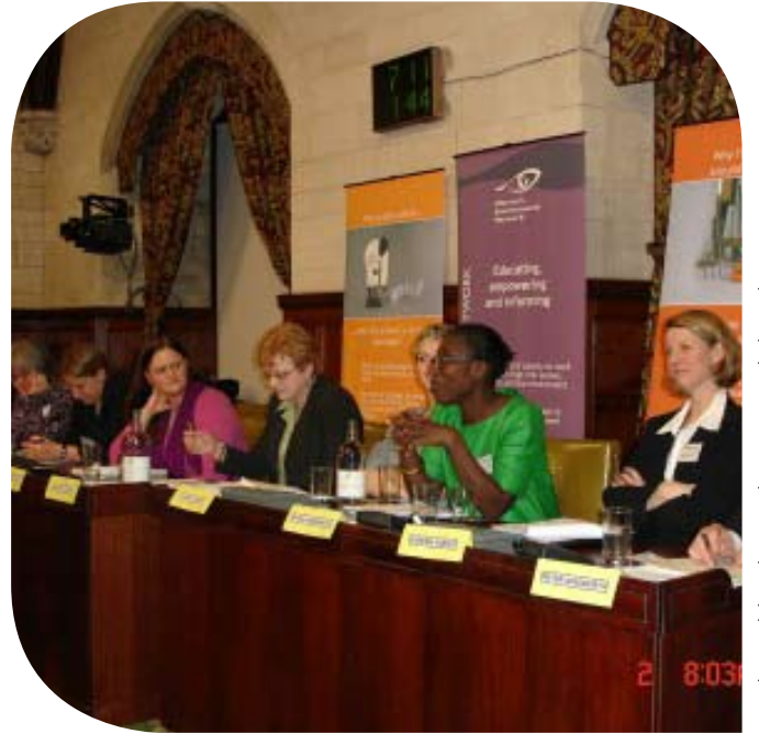
Gender and the Climate Change Agenda launch

(see the video clips) and there are special offers, news, and competitions. Please have a look.