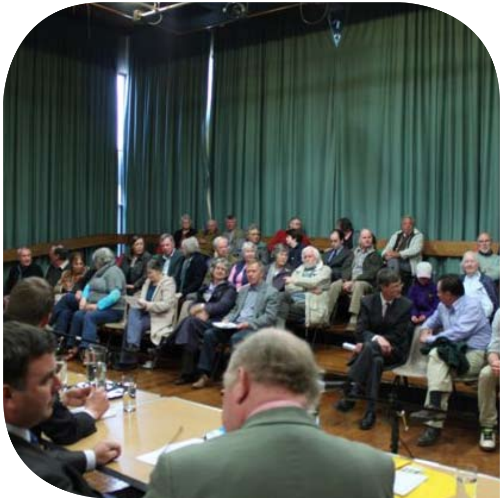
Crediton General Election Hustings, 2010

The candidates appeared to be quite well prepared, were good natured to one another and generally fielded the questions to the best of their abilities. This was the first hustings I had ever attended and found it very interesting and informative. I was most interested in their answers to the environmental question and was pleased to hear that all the parties, apart from UKIP, were basically in agreement with their policies to combat climate change and bring about a low carbon future for the UK.